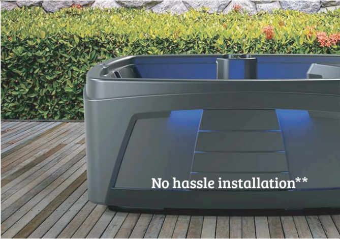
No hassle installation**