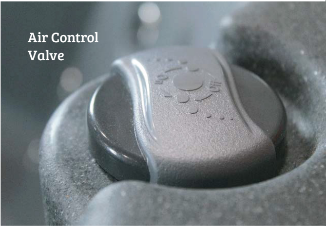
Air Control Valve