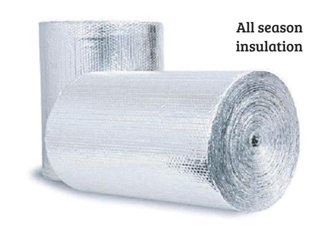
All season insulation