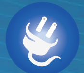
Plug 120V (convertible 240V)*