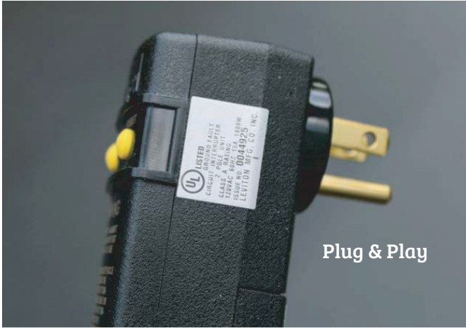
Plug & Play